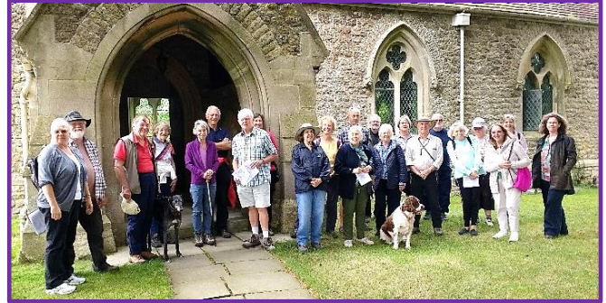
Ready to go - 25 pilgrims and 3 dogs

What was the weather going to be like? This was the main question we all asked ourselves when the day of our first Benefice Pilgrimage dawned. We needn't have worried. The Lord made sure that the first drops of rain only fell as the drinks were being poured at Bourton Club on our return.