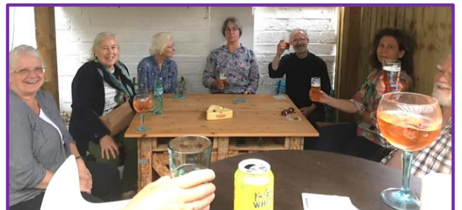
A celebratory drink at Bourton Club